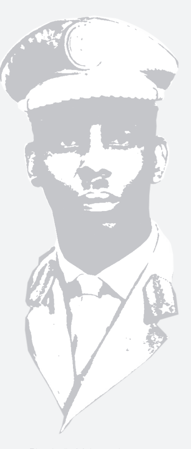
ic: Jaalle Mohamed Siad Barre

The collapse of Somalia's central government in 1991 led to three decades of conflict, leaving the country in a state of chronic political instability, widespread insecurity and food shortages, with frequent human rights violations and abuses; including unlawful killings, destruction of property, mass displacement, rape and sexual violence. Efforts to restore peace, stability and normality of state functions faced numerous challenges, which culminated in a number of peace processes, agreements and major transitional arrangements. The establishment of a Federal Government in 2012, with a "road map" towards stabilization, recovery, and reconstruction, ended a decade long process of weak transitional governments. Since 2012, Somalia has attempted to rebuild its legal, judicial, military, police and local government sectors. While significant progress has been made, the state still struggles to address the lack of adherence to rule of law and to tackle impunity for human rights violations and abuses.